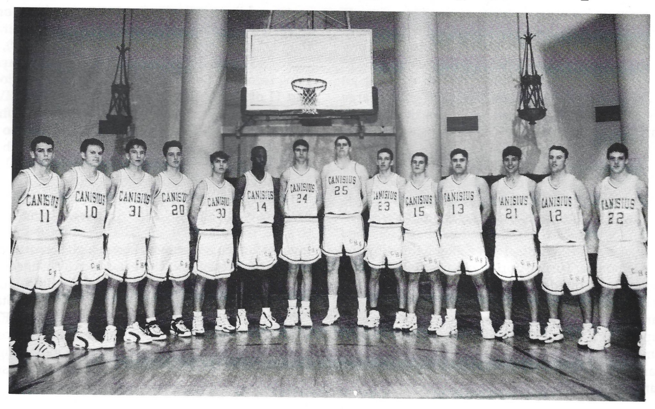
CANISIUS HIGH SCHOOL