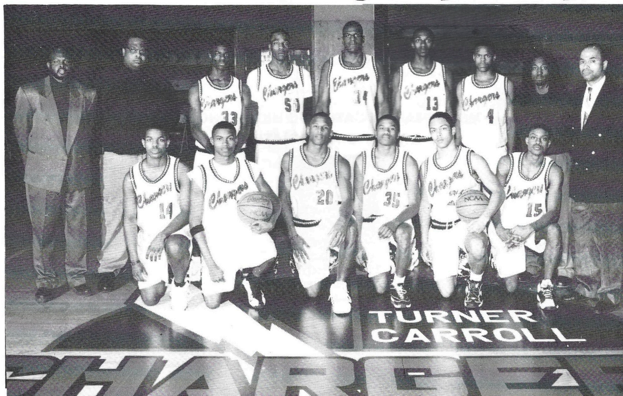
TURNER/CARROLL HIGH SCHOOL